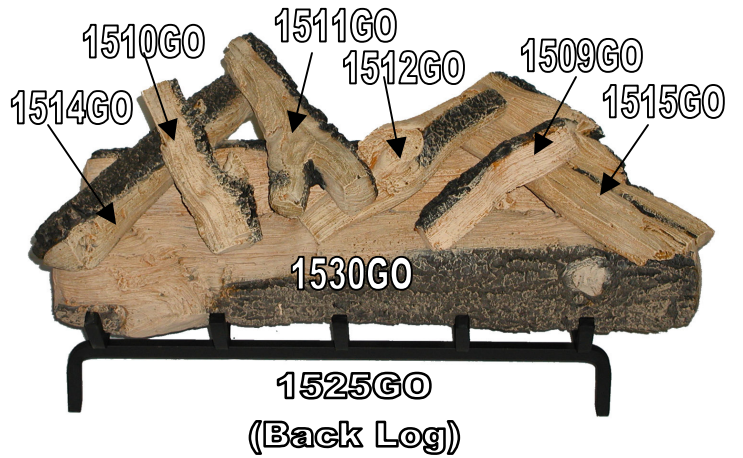
WPS3008AA 30" Set