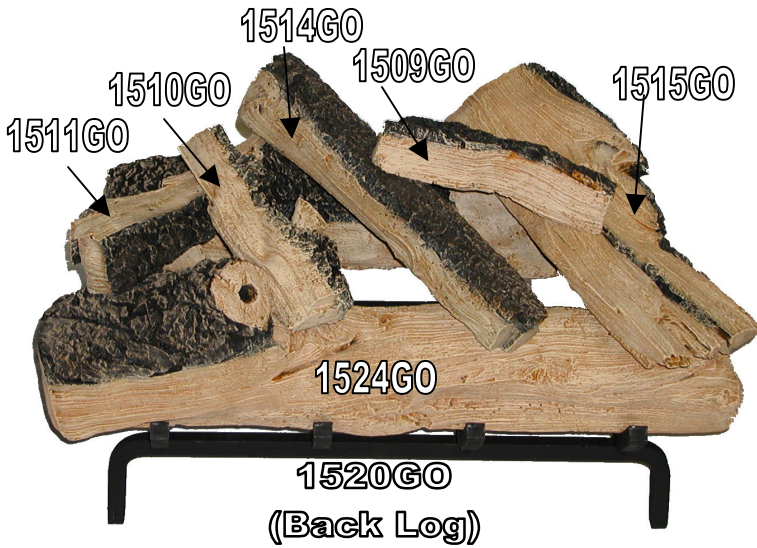
WPS2407AA 24" Set