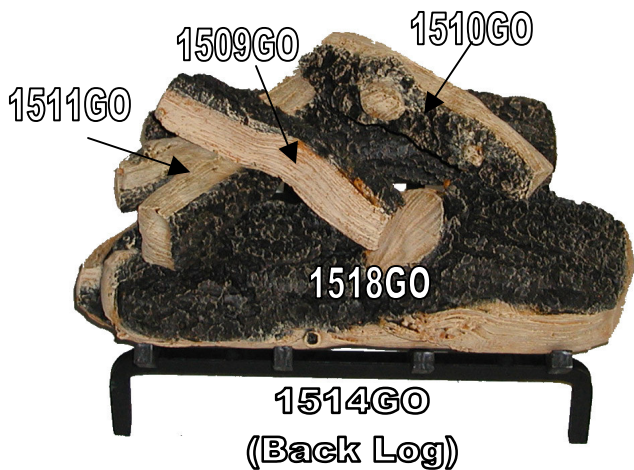
WPS1805AA 18" Set